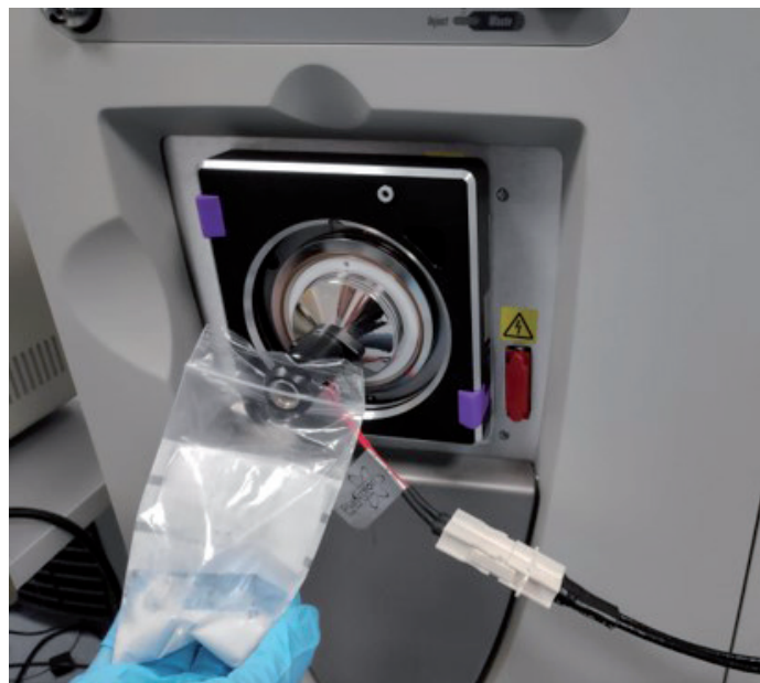
Figure 1 - Direct MS analysis of sample headspace via SICRIT ® (shown on Thermo LTQ Orbitrap).

The SICRIT ® ion source can be adapted to every LC-MS instrument, transforming it to an online-sensor, where samples can be analyzed by simply holding the sample of interest in front of the MS inlet!